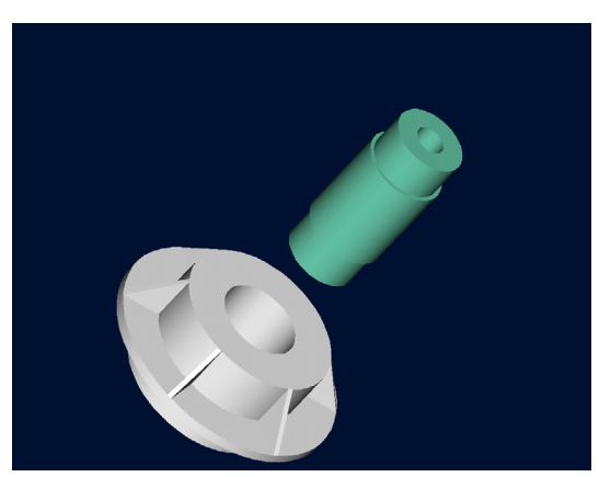
Figure 2 Trunnion slided through the hub after contracting

For this new bridge, he needs to fit a hollow trunnion of outside diameter 12.363" in a hub of inner diameter 12.358". His plan is to put the trunnion in dry ice/alcohol mixture (temperature of the fluid - dry ice/alcohol mixture is -108^{\circ}F ) to contract the trunnion so that it can be slided through the hole of the hub. To slide the trunnion without sticking, he has also specified a diametrical clearance of at least 0.01" between the trunnion and the hub. Assuming the room temperature is 80^{\circ}F , is immersing it in dry-ice/alcohol mixture a correct decision? What temperature does he need to cool the trunnion to so that he gets the desired contraction?