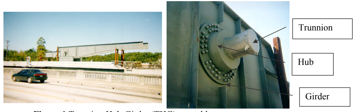
Figure 1 Trunnion-Hub-Girder (THG) assembly.

To make the fulcrum (Figure 1) of a bascule bridge, a long hollow steel shaft called the trunnion is shrink fit into a steel hub. The resulting steel trunnion-hub assembly is then shrink fit into the girder of the bridge.