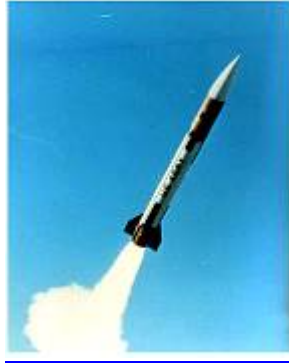
Figure 1 Patriot missile

should aim next, it calculates the velocity of the Scud and the last time the radar detected the Scud. Time is saved in a register that has 24 bits length. Since the internal clock of the system is measured for every one-tenth of a second, 1/10 is expressed in a 24 bit-register as 0.00011001100110011001100. However, this is not an exact representation. In fact, it would need infinite numbers of bits to represent 1/10 exactly. So, the error in the representation in decimal format is