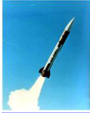
Figure 1 Patriot missile

should aim next, it calculates the velocity of the Scud and the last time the radar detected the Scud. Time is saved in a register that has 24 bits length. Since the internal clock of the system is measured for every one-tenth of a second, 1/10 is expressed in a 24 bit-register as 0.00011001100110011001100. However, this is not an exact representation. In fact, it would need infinite numbers of bits to represent 1/10 exactly. So, the error in the representation in decimal format is